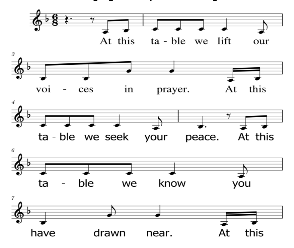
Prayer At This Table Choir sings the first time, Pastor prays, congregation repeats the song.

The Message The Table of Grace Pastor Kris