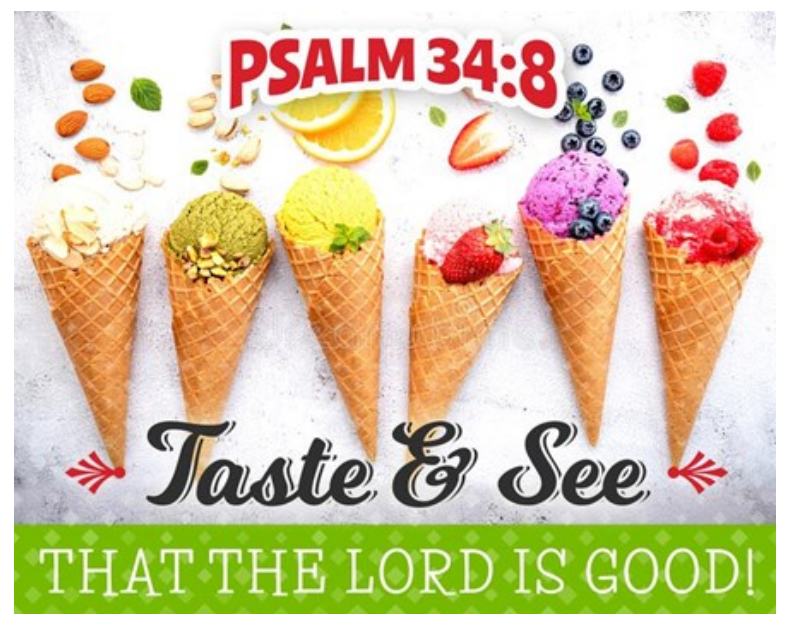
July 3, 2022 10:30am Summer Worship in the Sanctuary

GUESTS, Welcome to our faith community here at Union UCC. To learn more about us please visit our website at <u>www.unionucc.org</u> or like us on Facebook at <u>www.facebook.com/unionneffs</u>. Please complete the Welcome Card in the racks in front of you or at the welcome tables and hand it in with your offering or give it to a pastor. This is a good way to let us know you're here.