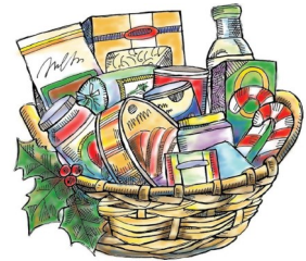
Reverse Advent Basket

Another BIG THANK YOU to everyone who filled HOLIDAY HOPE CHESTS for local children. This project is organized by the Volunteers of the Lehigh Valley.