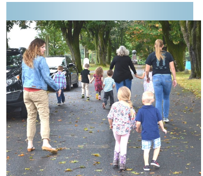
Sneaker Stroll Above; Allentown CROPWalk Below

As a whole, twenty-eight congregations raised a total of $26,109.09 today for the Allentown CROP Walk. From my past experience with the CROP Walk, the grand total on the day of the CROP Walk always inches higher and higher in the days and weeks that follow the walk so I will not be surprised at all if this year's total eventually reaches $30,000.