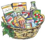
Reverse Advent Basket

For the second year, we will be handing out baskets and advent calendars to interested families. The idea is to put something IN the basket each day of Advent. Bring the filled basket back to church between Christmas Eve and New Years Day and we will deliver your Holiday donation to the FOOD BANK. Help your family give to others every day of Advent. Baskets will be handed out 11/19 and 11/26.