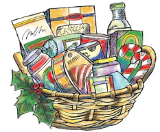
Reverse Advent Basket

THANK YOU to everyone who took a Reverse Advent Calendar Basket. Please bring your filled baskets to church anytime between Christmas Eve and New Year's Day.