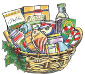
Reverse Advent Basket

This year, we will be handing out baskets and advent calendars to interested families. The idea is to put something IN the basket each day of Advent. Bring the filled basket back to church between Christmas Eve and New Years Day and we will deliver your Holiday donation to the FOOD BANK. Help your family give to others every day of Advent. Sign up in the foyer 11/6 and 11/13. Baskets will be handed out 11/20 and 11/27.