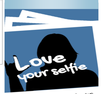
union UCC Youth Group

<u>For Online orders</u>: Delivery is free to the church, or with shipping added orders can be delivered to your home.